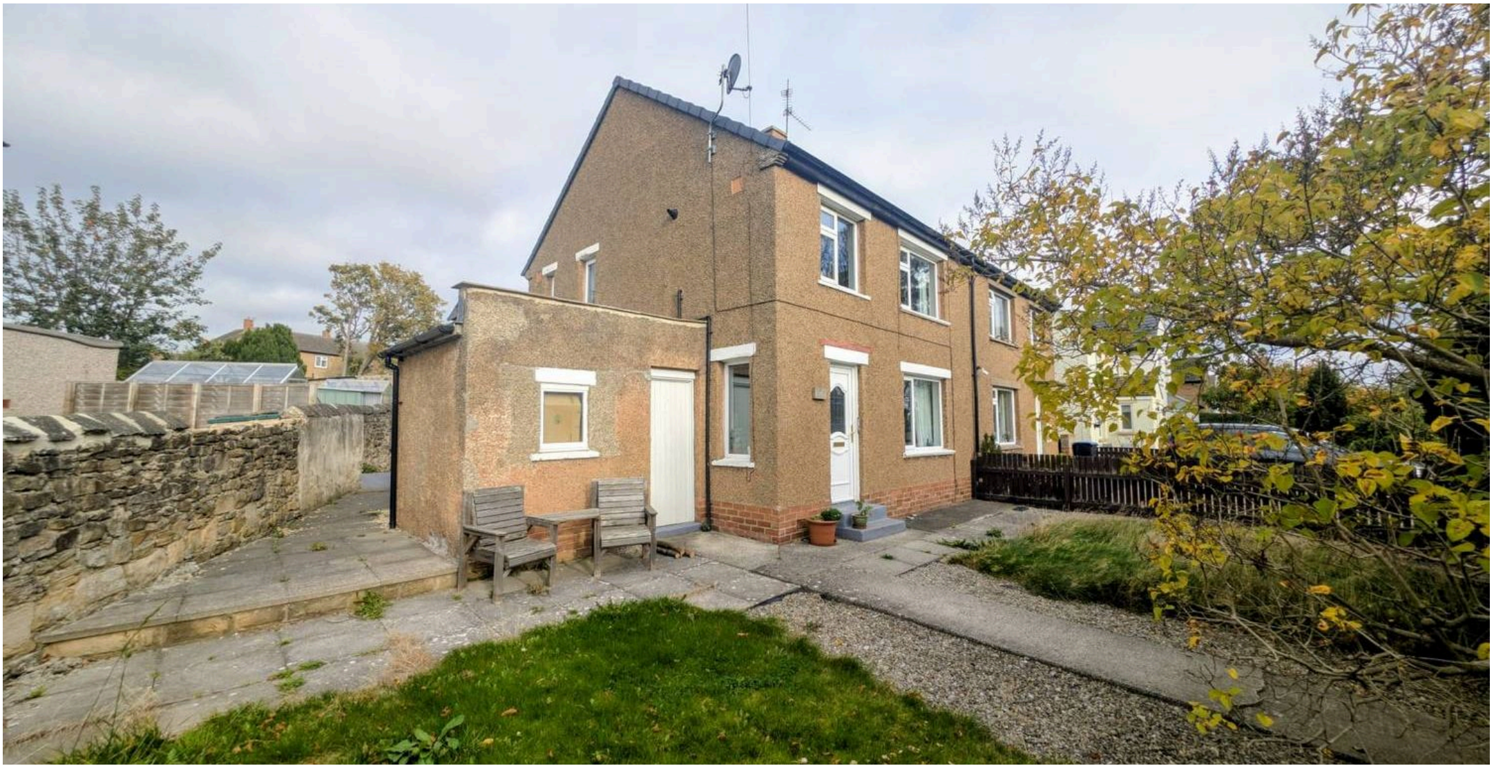
1 Green Lane, Barnard Castle Barnard Castle