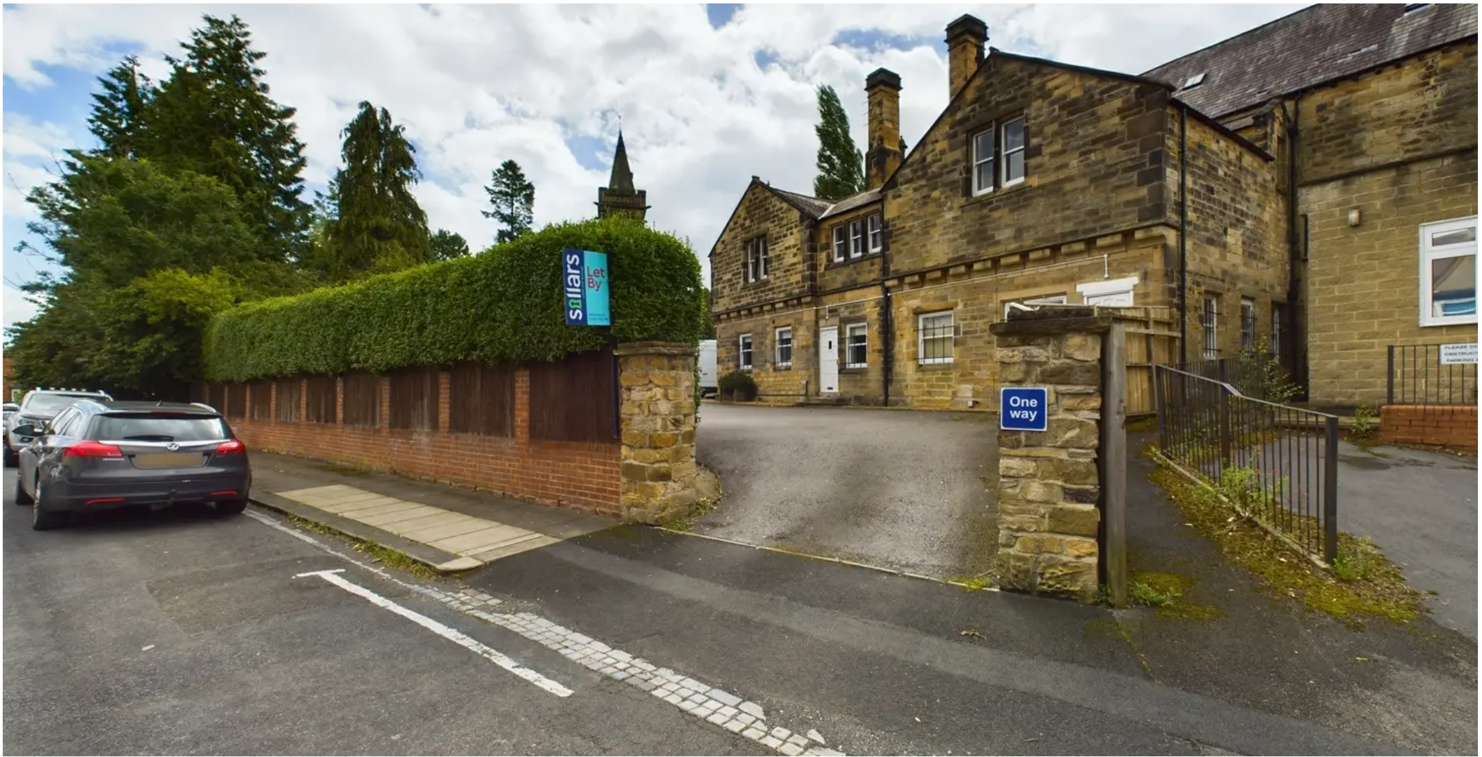
Tower House, Tower Road, Darlington Darlington